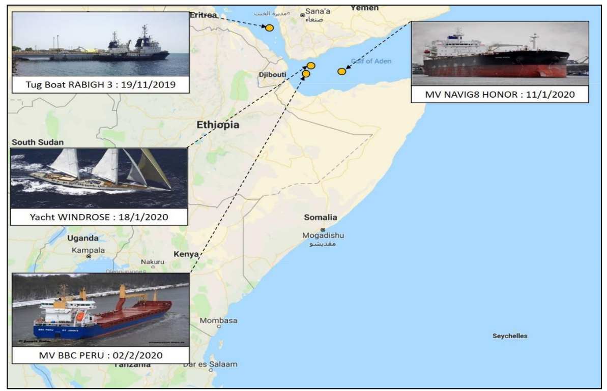
Figure 1 - Geographic Location of Maritime Events

18. 02 Feb 20 . Also in the GOA, MV BBC PERU reported that she had been approached by one skiff that was travelling at 17kts with 4 POB. The occupants of the skiff displayed no aggressive behaviour and no piracy tripwires were present.